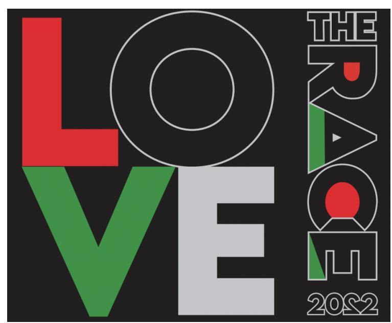
Tuesday, September 27th - Approx. 11:45am EST